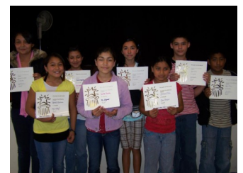
4-6 grade who received the CHARACTER COUNTS! Respect award.