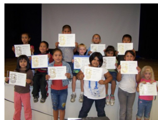
K-3 students who received the CHARACTER COUNTS! Respect award.